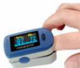
Fingertip Pulse Oximeter M-50A