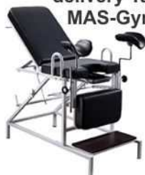
Gynaecology delivery Table MAS-Gyn3