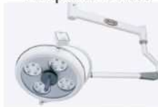
LED Operating Lamp MAS-LED30s