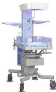
infant radiant warmer MAS-4000A