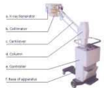
Mobile X-Ray Machine