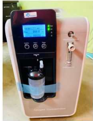
Oxygen Concentrator 5L SZ-5BW