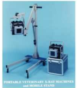
Veterinary portable x-ray