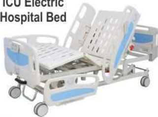
5 Function ICU Electric Hospital Bed