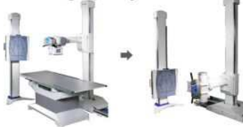
High Frequency X-Ray Radiograph System