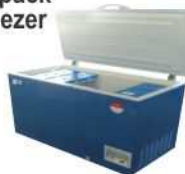
Vaccine icepack freezer