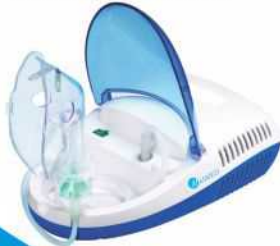
Piston Compressor Nebulizer BD 5002