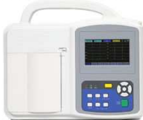
Digital 3 Channel ECG Machine MAS-203T