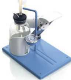
Manual Suction unit MAS-7B