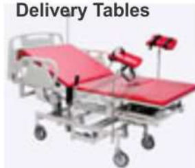
Electric Delivery Tables