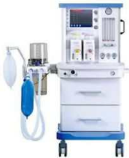
Anaesthesia Machine -MAS6100A