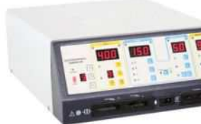
High Frequency Surgical Unit MAS-EB300