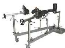
Orthopedic traction frame