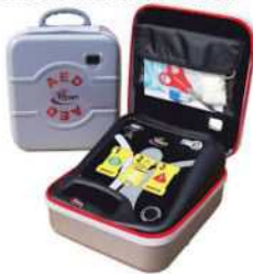
Defibrillator AED Automated External