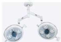
LED Operating Lamp LED20