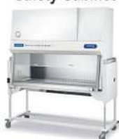
Biological Safety Cabinet