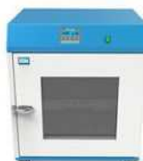
Fluid Infusion Blood Warmer Thermostat BFW-1050B