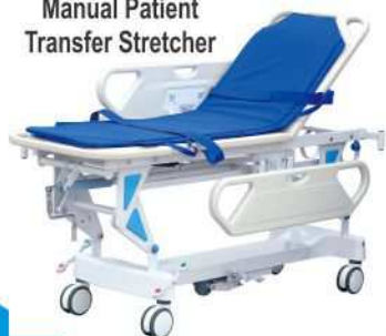
Manual Patient Transfer Stretcher