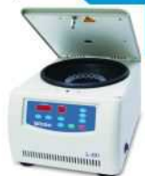
High Speed Refrigerated Centrifuge