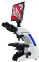
Digital Microscope with LCD Screen MAS-BIO04