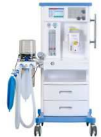
Anesthesia machine M-S6100D