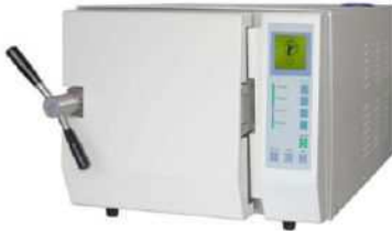
Autoclave Class B Large volume