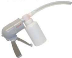
Manual Hand Suction Device