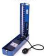
BP Mercury sphygmomanometer Ms1120