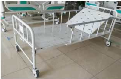
1 crank manual hospital bed