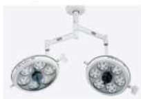
LED operating lamp MAS-LED30