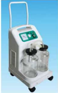
Electric Suction machine MAS-S23