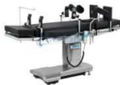
OT Fully Electric Operating Table MAS-400E