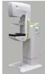
Digital MAMMOGRAPHY NAVIGATOR