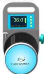
Fluid Infusion Blood Warmer