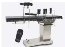
OT Semi-electric Surgical Operating Table