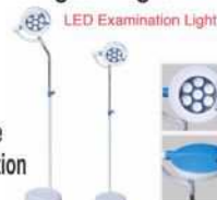
Mobile LED Surgical Light