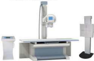
High Frequency X-ray Radiograph System 55kW PLX6500