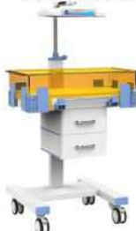
Infant phototherapy unit LED BL-50D