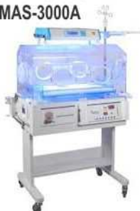
Infant incubator MAS-3000A