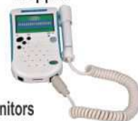
Pocket Vascular Doppler