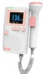
Fetal Doppler MAS-FD88