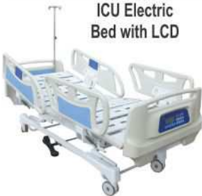
5 Function ICU Electric Bed with LCD