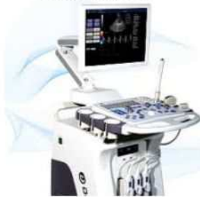
Basic 4D Color Doppler Ultrasound M-C80