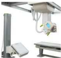
X-Ray DR Digital System