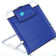
Backrest 5-position Adjustable