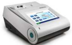
Blood Gas Analyzer and Electrolyte