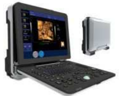
New general Portable 4D Ultrasound Scanner MAS-P6