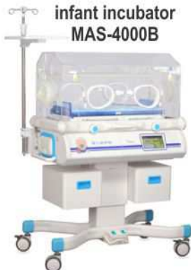
infant incubator MAS-4000B