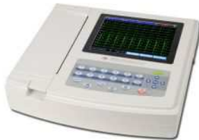
ECG 12 Channel Digital ECG machine