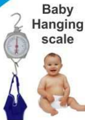
Baby Hanging scale