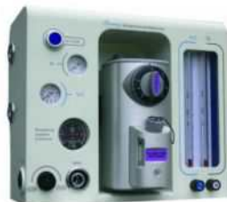
Portable Anesthesia machine