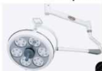
LED Operating Lamp LED20s