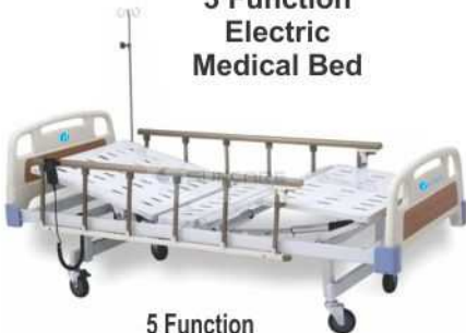
3 Function Electric Medical Bed