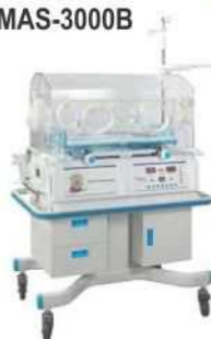
Infant incubator MAS-3000B