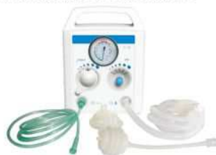
Infant resuscitator T-PIEC TS100 Infant resuscitator T-PIEC