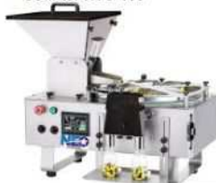
Tabletop Tablet Capsule Counter NTC-100