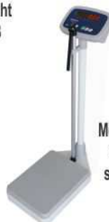
Medical height and weight scale PT-815