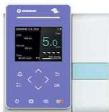
Infusion Pump MAS-V3