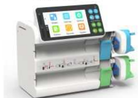
Syringe Pump Double MAS-S5D