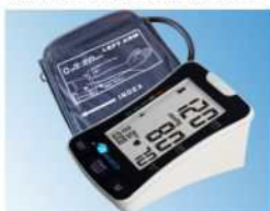
BP Fully Automatic Arm Blood Pressure Monitor