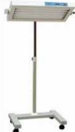
Phototherapy Unit MAS-400A