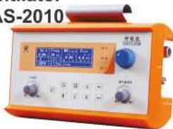
Emergency Ventilator MAS-2010