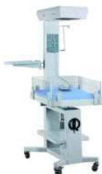
infant radiant MAS-3000A