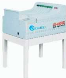
X-ray Film Processor