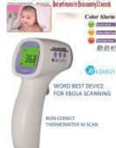
Non Contact Thermometer