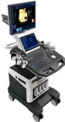
4D Color Doppler Ultrasound MAS-T6