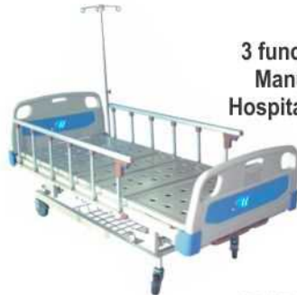
3 function Manual Hospital bed