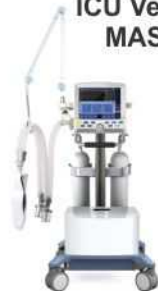
ICU Ventilator MAS-R50