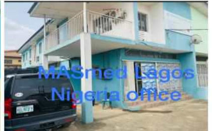
MASmed Lagos Nigeria office