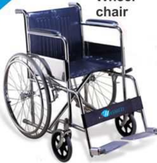
Adult Wheel chair