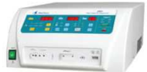
Electrosurgical unit MAS-EB03