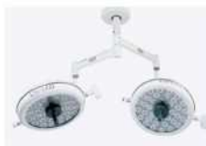
LED Operating Lamp