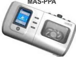
Auto CPAP Machine MAS-PPA