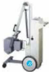
High Frequency Mobile X-ray machine