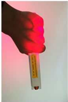
Handheld infrared vein finder NE-501