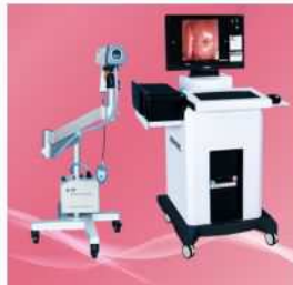
Colposcope Digital Imaging System