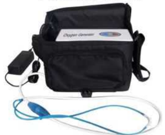
Oxygen Concentrator Portable POC-01