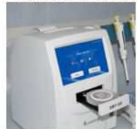
DRY CHEMISTRY ANALYSER Sm100