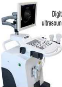
Digital Trolley B-W ultrasound system MAS-C50