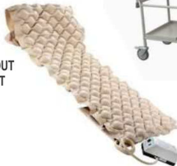
Pressure Mattress Ripple