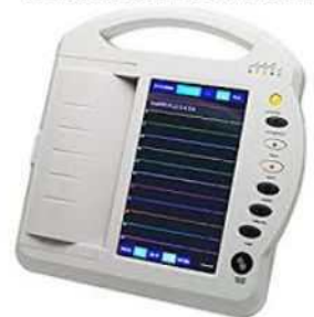
ECG 12 channel digital Touch screen ECG-MAS12T