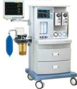
Anesthesia Machine MAS-302