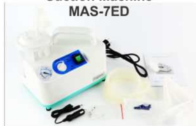
Portable rechargeable Suction Machine MAS-7ED