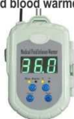
Fluid Infusion and blood warmer