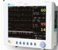
Multi-Parameter patient Monitor P25