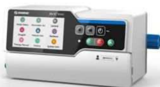
Infusion Pump MAS-V7