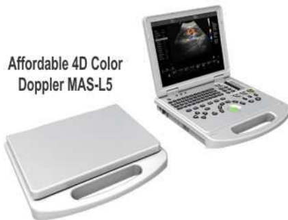
Affordable 4D Color Doppler MAS-L5