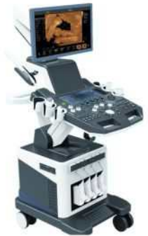
New general Portable 4D Ultrasound Scanner MAS-P6