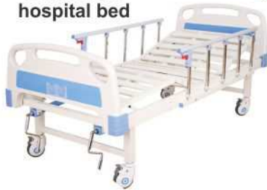
2 function hospital bed