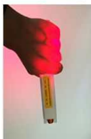
Electronic infrared vein finder NE-501