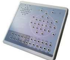
EEG Machine KT88-2400