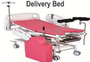
Hydraulic Multifunctional Delivery Bed