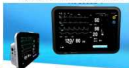
Multi-Parameter Patient Monitor MAS-P30E