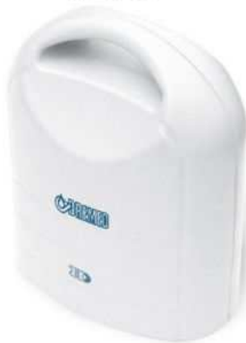
Heavy Duty Piston Compressor Nebulizer BD 5005